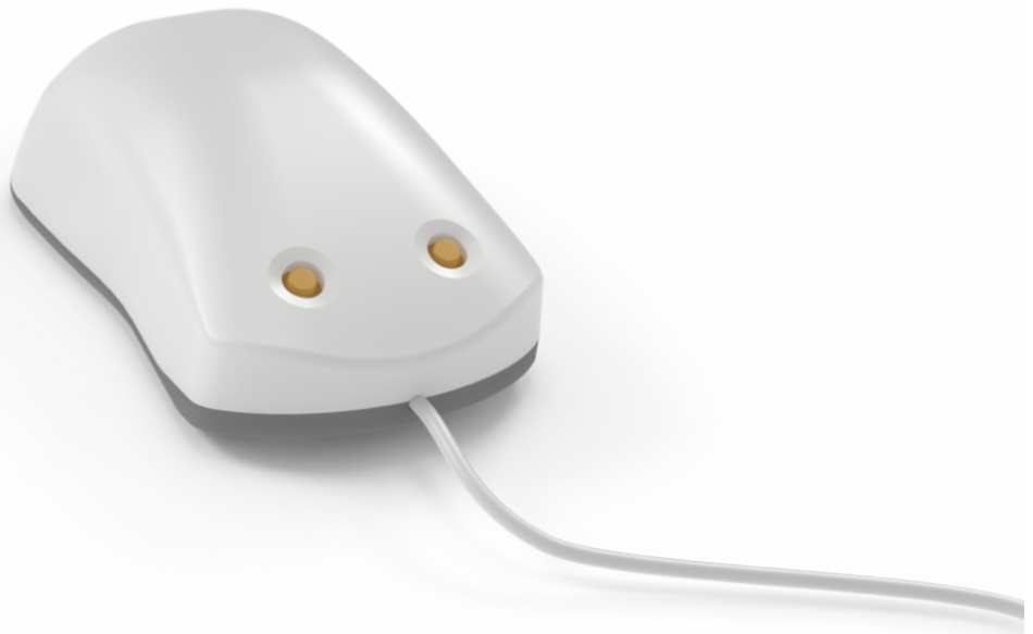
Figure 1. Two-point vibrotactile stimulator (the Brain Gauge; Cortical Metrics; Chapel Hill, NC).